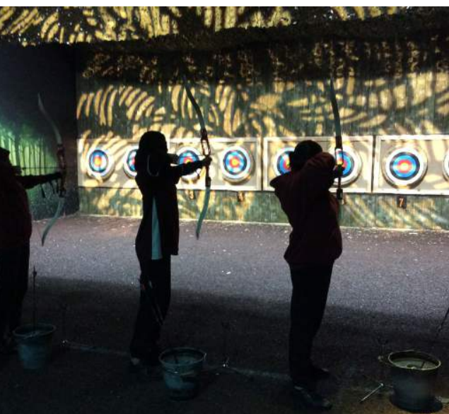
YEAR 11 BEAR GRYLLS TRIP