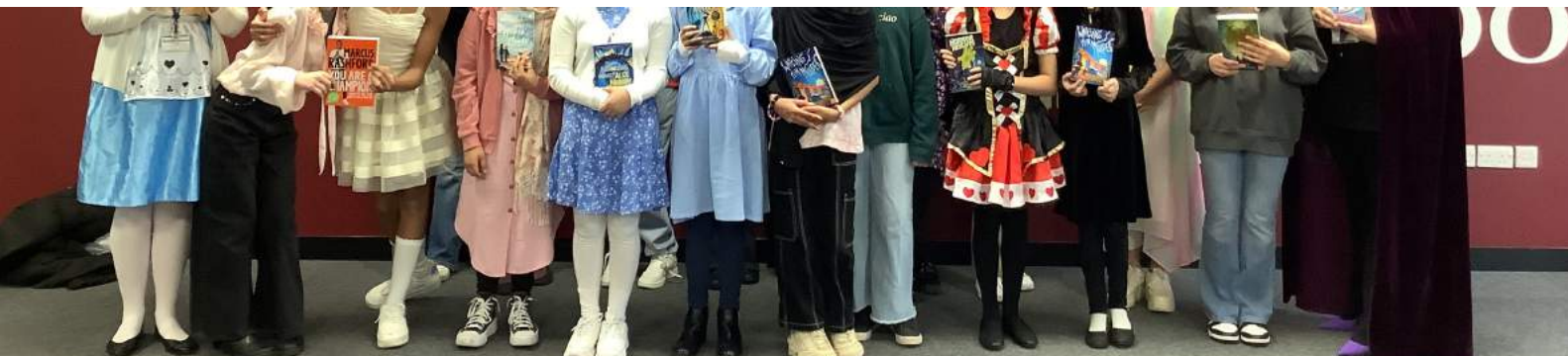
YEAR 7 WORLD BOOK DAY 2024