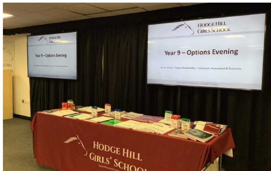
YEAR 9 OPTIONS EVENING 2024