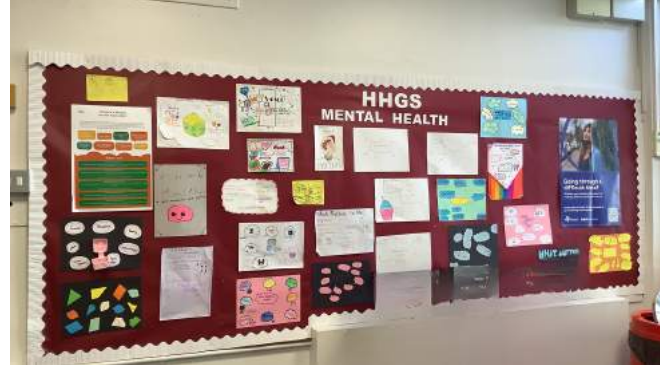
CHILDREN'S MENTAL HEALTH WEEK 2024