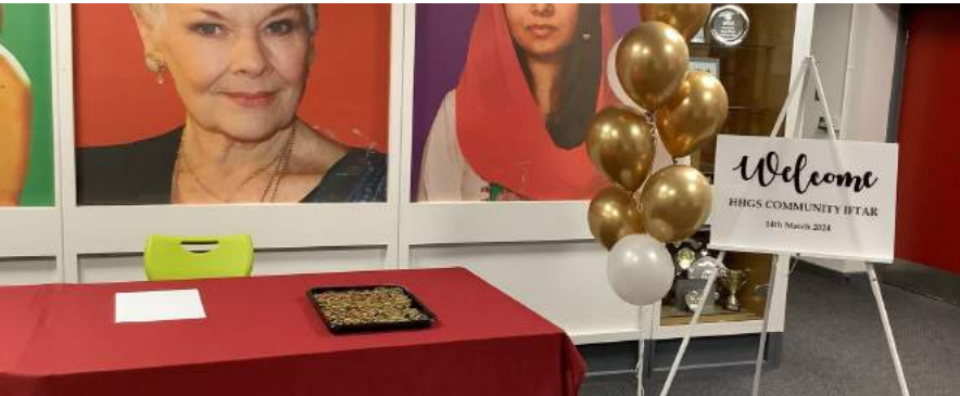
COMMUNITY IFTAR 2024

NEWS, HIGHLIGHTS AND UPDATES FOR PARENTS/CARERS